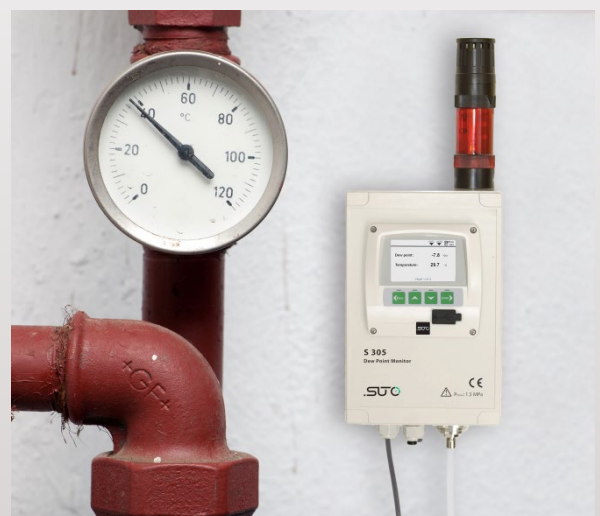
optional alarm unit mounted on the housing